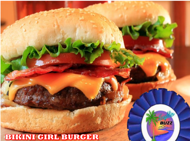
BIKINI GIRL BURGER

Gluten free buns available for an additional charge.